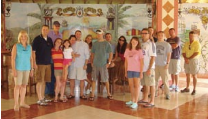
The Embassy group at the Bacardi Factory tour on Labor Day.